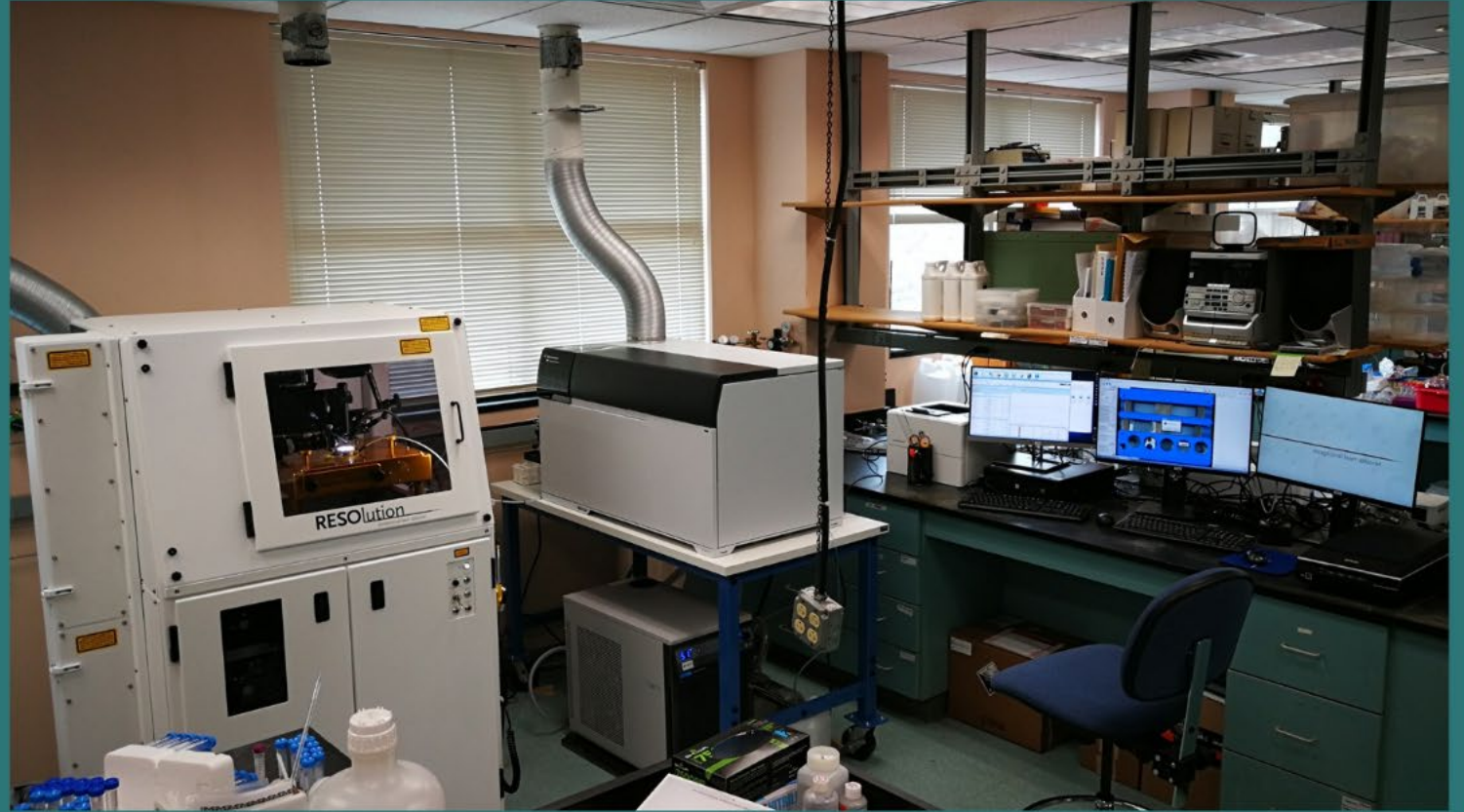
TYPICAL MASS SPECTROMETER